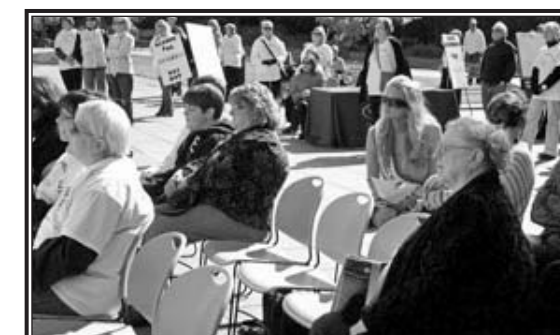
Supporters gather for the Dyslexia Awareness Day Rally.