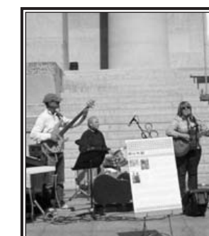
Speakers and singers delivered their messages at the Dyslexia Awareness Day Rally.